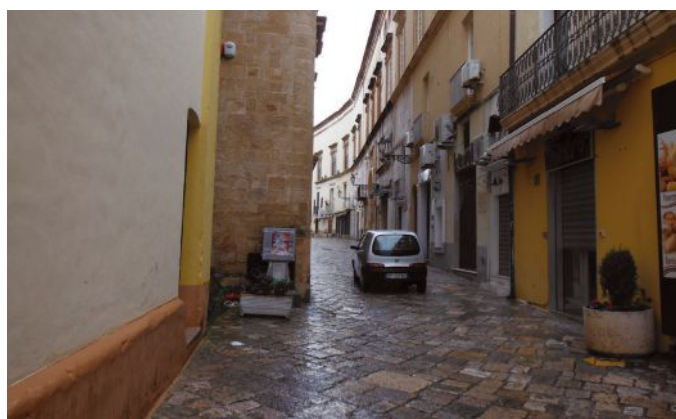
Figure 1 Typical narrow Italian medieval street (Gallipoli, Puglia).

Each city determines its own list of authorized vehicles, the time periods of restriction, and exemptions for deliveries. The variations between cities is illustrated in Table 1. Some cities create other restrictions; for example, the city of Nardó, Puglia prohibits vehicles that weigh more than 1.5 metric tons and one of Turin's zones prohibits vehicles with a height exceeding 11.5 feet (3.5 m). Turin initially had a two concentric zones with different restrictions for the inner and outer zones; in 2009, this two-tiered system was abandoned and the stricter rules were applied to the entire ZTL.