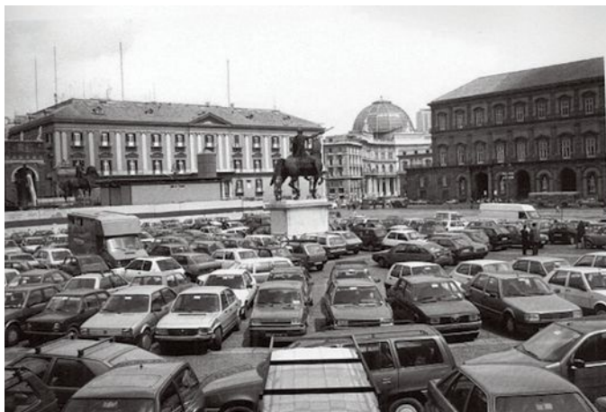
Figure 3. Piazza Plebiscito used as a parking lot.

Genoa also established a ZTL in 1989 as did Firenze in 1990. In the 1990s the ZTL concept quickly spread to cities across Italy. In the 2000s, the number and size of ZTLs continued to expand. For example, between 2008 and 2013, Bari's zone more than doubled and Florence's ZTL increased by 15 percent, an increase of 0.22 sq. mi. (0.57 sq. km.) and Milan's ZTL increased in size by 70 percent, which added 6 sq. km. Milan, Palermo, Roma and Florence currently have the largest ZTLs in terms of absolute size, (15.2, 7.7, 7.5 and 5.1 sq. km. respectively), but when expressed as a percentage of the total city surface area, the top three cities are Bergamo, (12.3 percent), Milan (8.4 percent) and Palermo (4.8 percent). 15