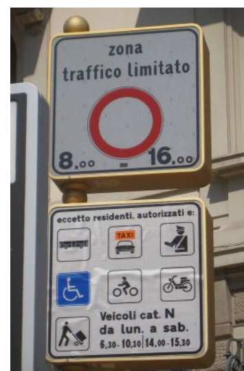
Figure 4. Entry sign at ZTL in Brescia.

Technology has made enforcement easier. The first electronic controls were installed in Bologna on October 1, 1994, (Alberto Croce, unpublished data). Rome began electronically monitoring in 2001 and Turin has electronically-monitored its ZTL since 2004. 17