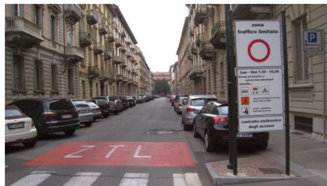
Figure 5. Pavement marking at entrance to ZTL in Turin.

Because ZTLs rely on signs and enforcement rather than on physical measures such as barriers or street redesign, they are easy and cheap to implement. Enforcement, however, was very time-consuming and difficult until the advent of electronic technology. This equipment is now the most expensive part of implementing ZTLs. Cities typically finance the capital cost with the revenue received from fines. For example the City of Brescia began electronic monitoring in January 1, 2007. Cameras were installed at twelve locations at a total cost of €615,000. Brescia receives sufficient revenue from fines such that the equipment will be paid off easily. (Personal communication between author Tira and the City of Brescia). After the equipment is paid for, the CdS allows cities to keep the fine revenue, but it must be spent on road safety improvements or traffic management.